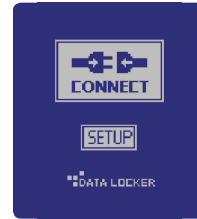
USB 3.0 Interface (USB 2.0 Compatible) No External Power Required