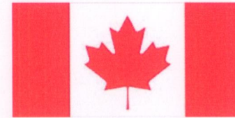
The Communications Security Establishment of the Government of Canada